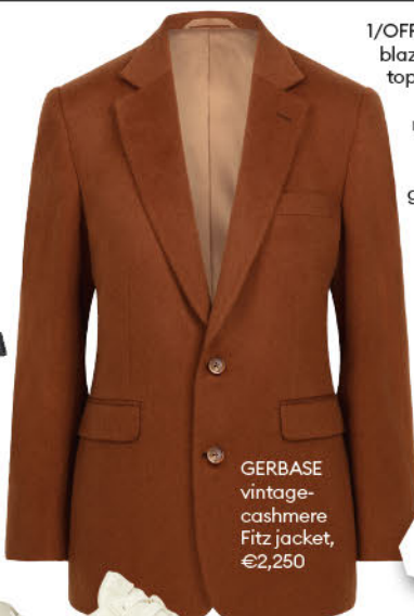
GERBASE vintage-cashmere Fitz jacket, €2,250