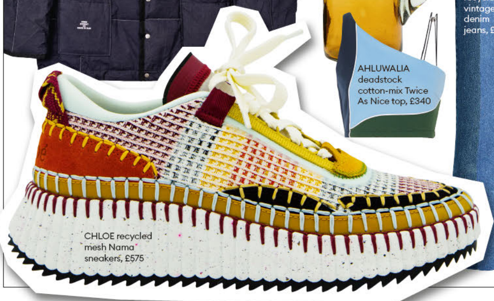
CHLOE recycled mesh Nama sneakers, £575