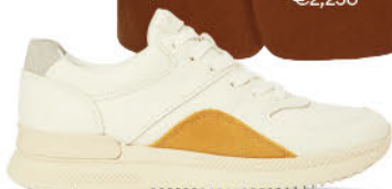
EVERLANE leather The Trainer sneakers with 54 per cent less virgin plastic and offset carbon emissions, £117