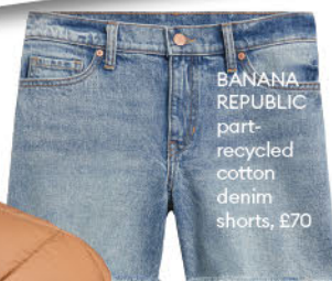
BANANA REPUBLIC part-recycled cotton denim shorts, £70