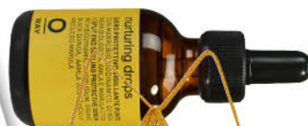
OWAY ethically produced Nurturing marula oil drops, £34