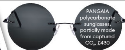
PANGAIA polycarbonate sunglasses, partially made from captured CO 2 , £430