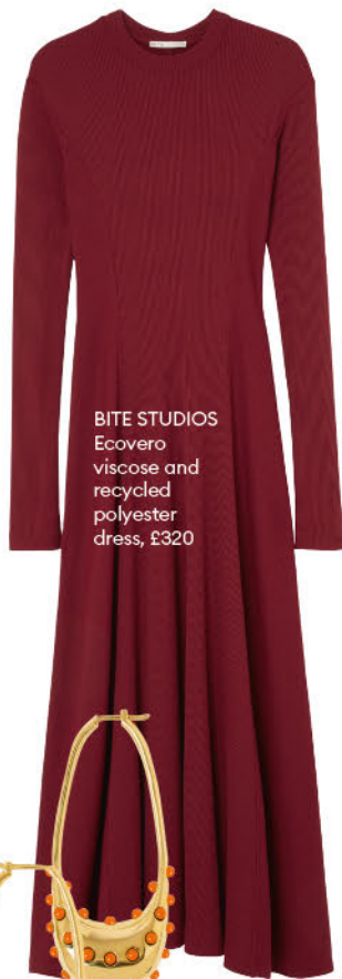
BITE STUDIOS Ecovero viscose and recycled polyester dress, £320