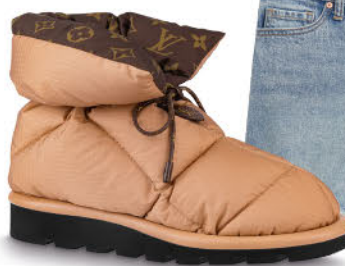
LOUIS VUITTON Econyl recycled and regenerated nylon Balboa boots, £810