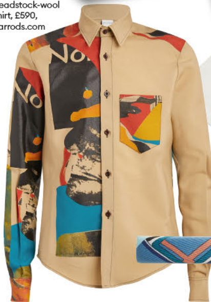
BETHANY WILLIAMS deadstock-wool shirt, £590, harrods.com