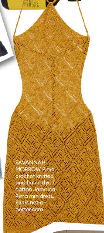
SAVANNAH MORROW Pima crochet knitted and hand-dyed cotton Jamaica Pima minidress, £349, net-a-porter.com