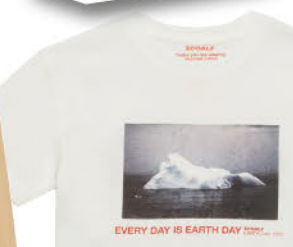
ECOALF recycled and organic cotton View Tee T-shirt, £30.99, zalando.co.uk