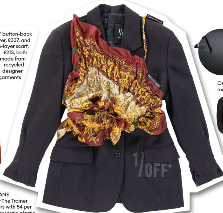
1/OFF button-back blazer, £337, and top-layer scarf, £213, both made from recycled designer garments