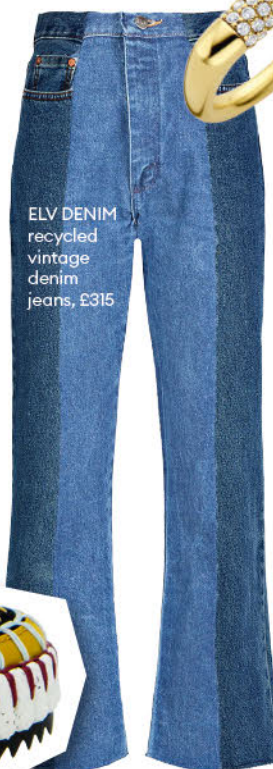
ELV DENIM recycled vintage denim jeans, £315