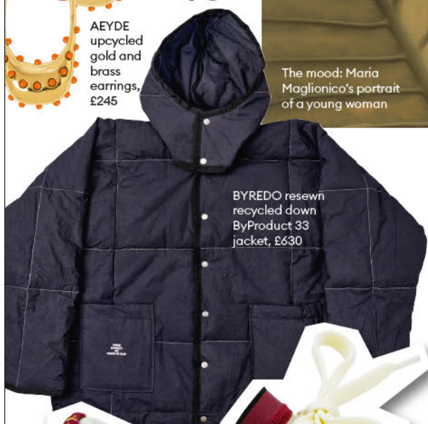
BYREDO re sewn recycled down ByProduct 33 jacket, £630