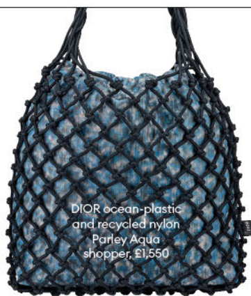
DIOR ocean-plastic and recycled nylon Parley Aqua shopper, £1,550