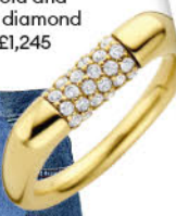
KIMAI x ALEX EAGLE recycled gold and lab-grown diamond Juno ring, £1,245